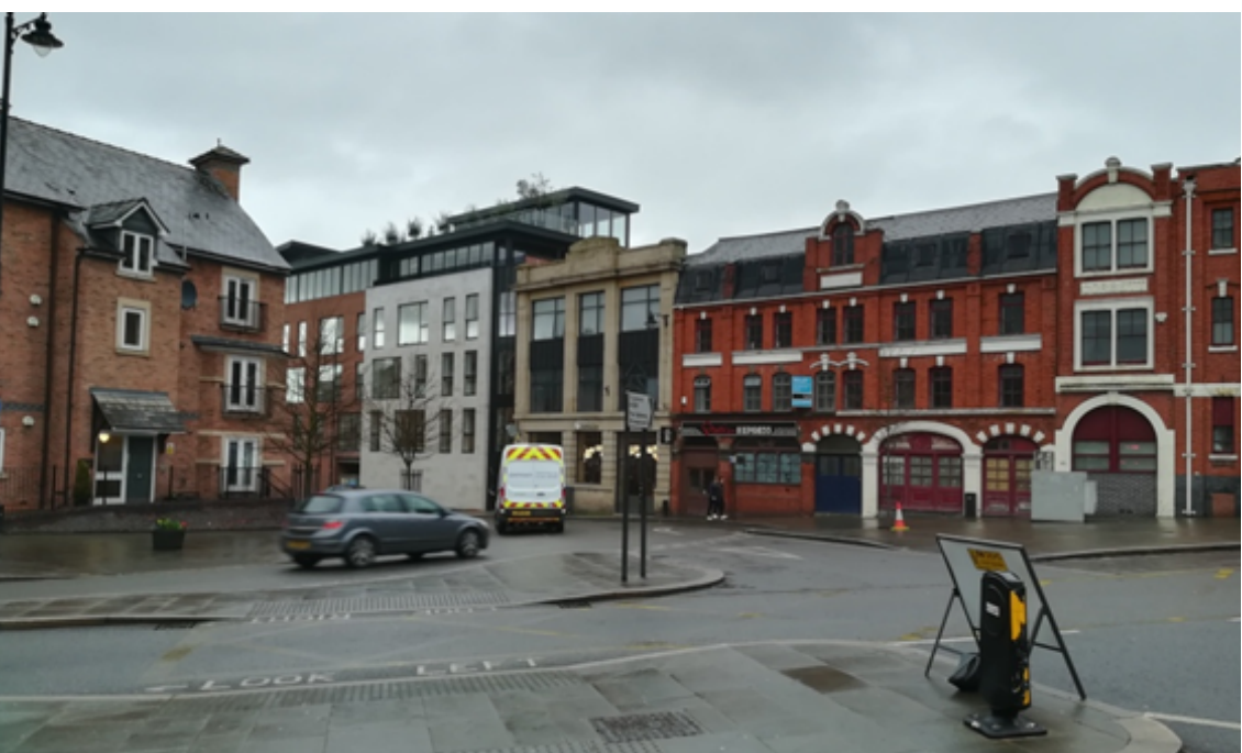
6.1.12 Similarly in views from the East, from the Dana footpath beneath the Grade I and Scheduled Shrewsbury Castle and from the forecourt to the railway station (which is also listed), the roof top addition would appear to sit uncomfortably on top of Chronicle House.