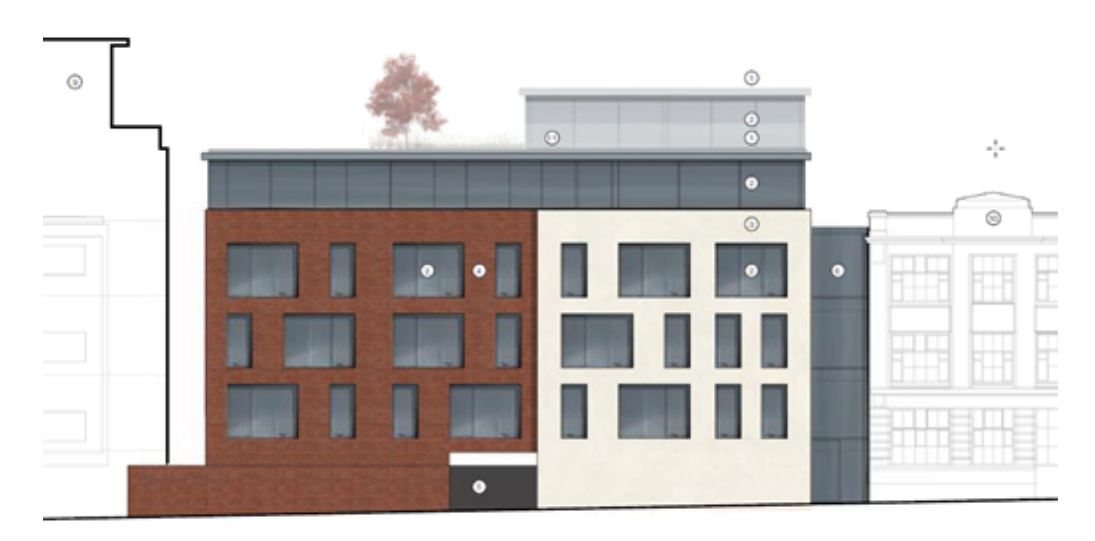
Previously refused application